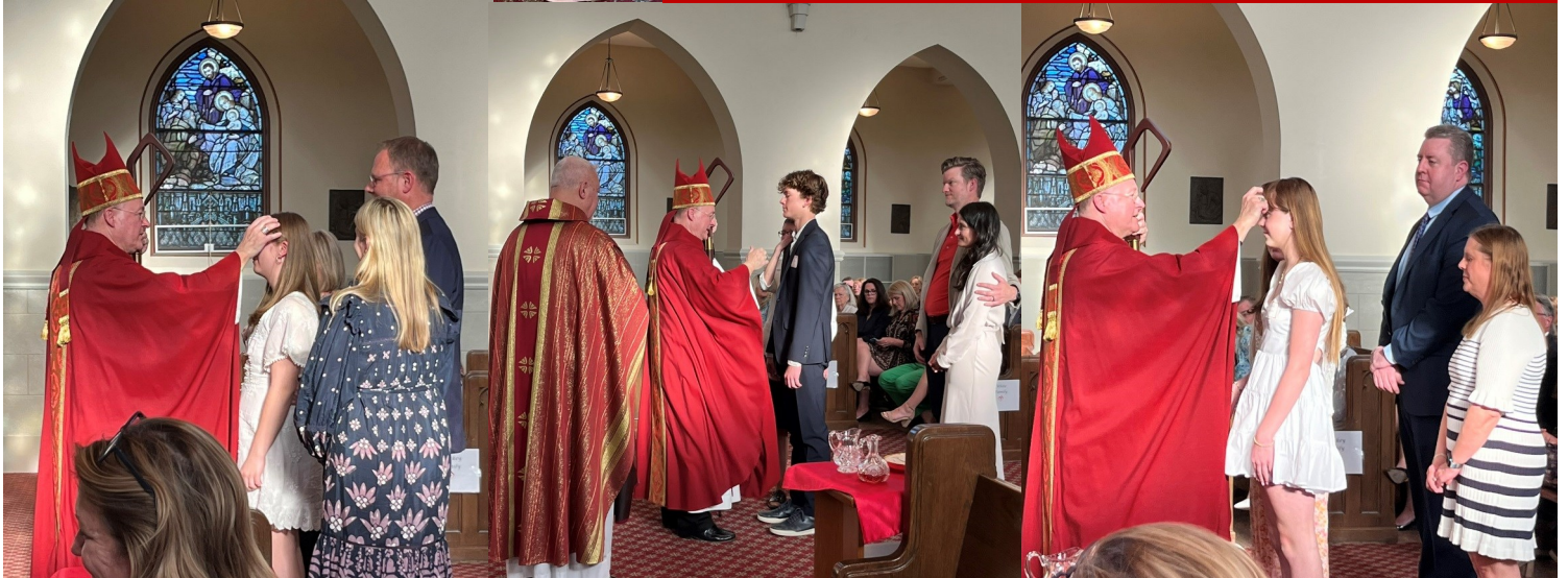
CONFIRMATION WITH BISHOP GROB APRIL 15, 2024