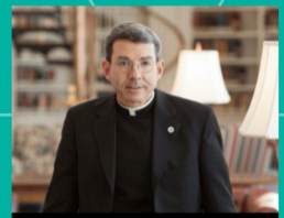
Divine Mercy Parish Center